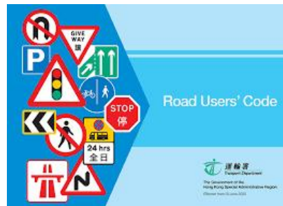
Road Users Guide